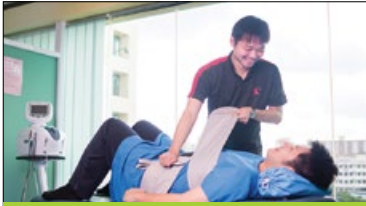
Spinal Decompression Therapy