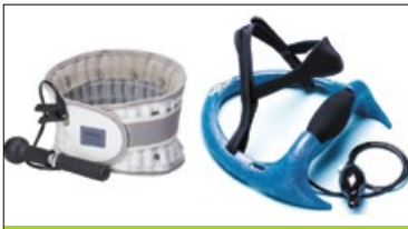
Home Care Products

Specific exercises to strengthen the weak muscles supporting the spine, helping to increase flexibility and balance and improve overall spine function.